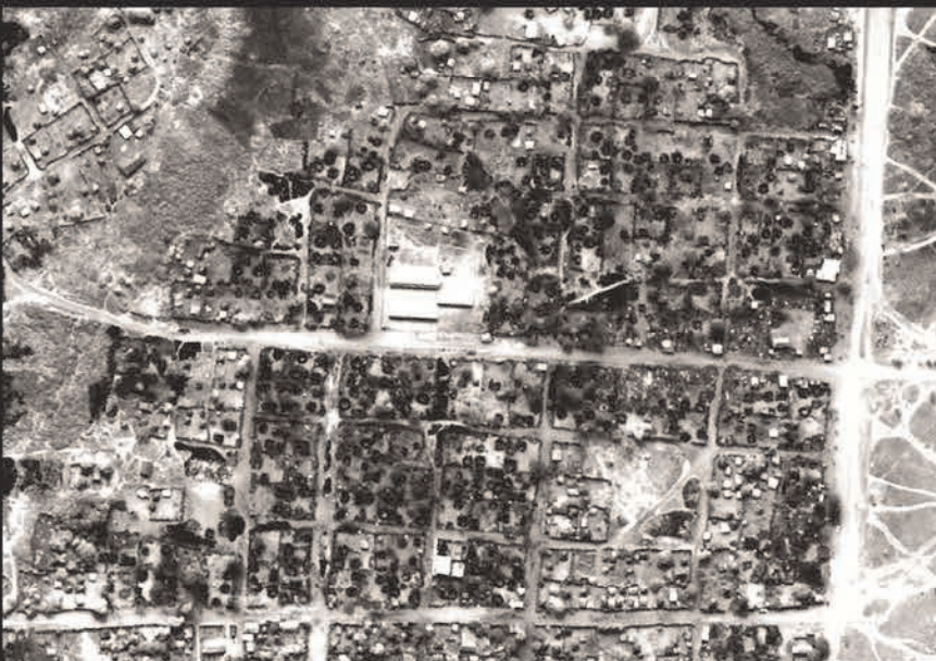
Bentiu town, South Sudan, on January 13, 2014.

Dozens of residential buildings on fire and massive smoke plumes visible in the town of Bentiu on the morning of January 11, a day after Government forces recaptured the town.