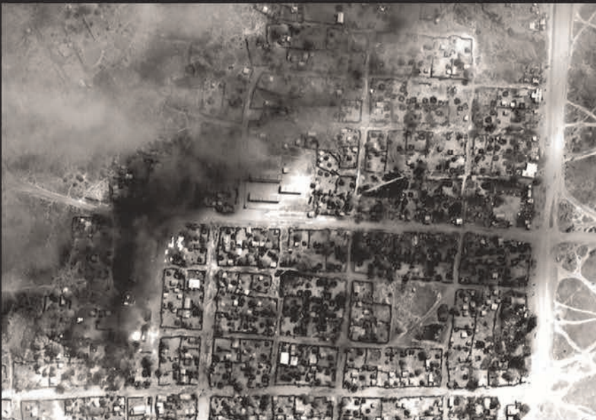
Bentiu town, South Sudan, on January 11, 2014.

Dozens of residential buildings on fire and massive smoke plumes visible in the town of Bentiu on the morning of January 11, a day after Government forces recaptured the town.