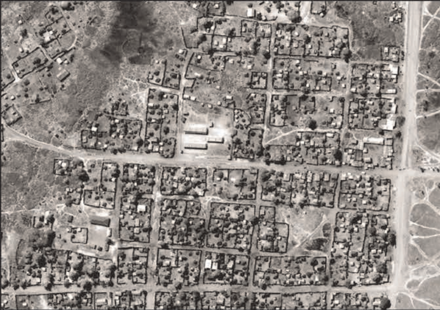
Bentiu town, South Sudan, on January 8, 2014.