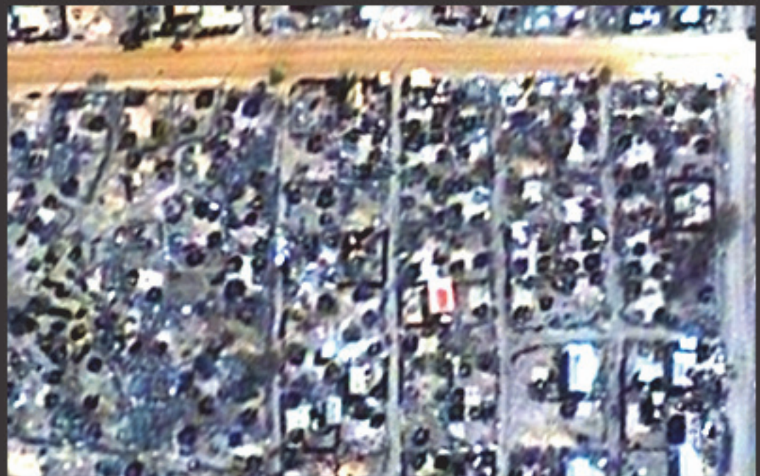
Images of a neighborhood close to the center of Malakal town taken on February 17 and again on February 23, showing burning of buildings. Opposition forces held the town between February 18 and March 19, 2014.