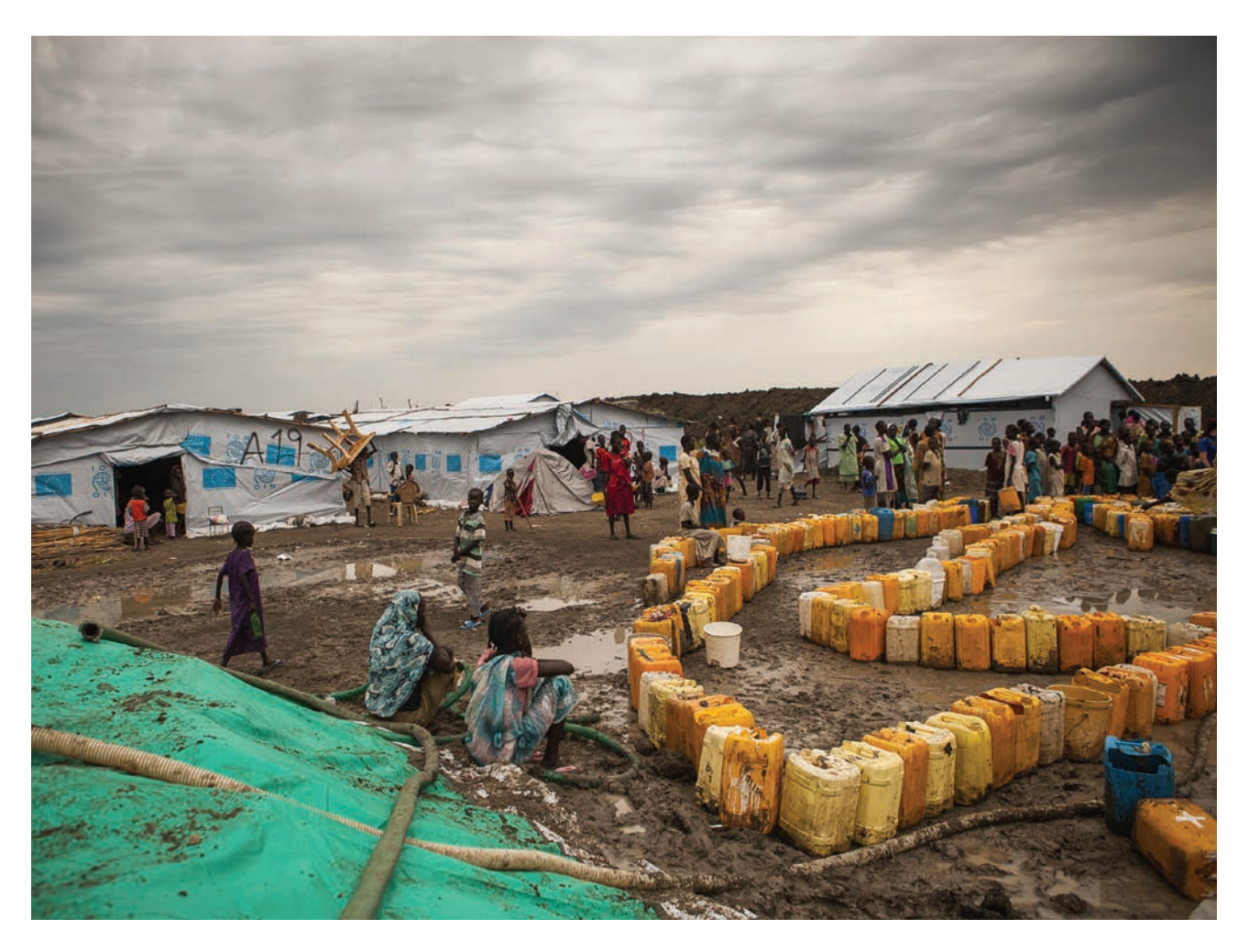
Women and children seek protection in a UN Protection of Civilians site.

months after the July crisis, 'the Force and Police components continued to display a risk-averse posture unsuited to protecting civilians from sexual violence and other opportunistic attacks', and that, on the rare occasions that the mission does conduct patrols around the POC sites, 'its soldiers peer out from the tiny windows of armoured personnel carriers, an approach ill-suited to detecting perpetrators of sexual violence'. Although the report led to the sacking of the UNMISS military commander, the mission's 'chaos and ineffective response' cannot be blamed on one recently appointed individual, and owes much more to the lack of accountability and culture of chronic risk aversion that has permeated the mission since its formation.