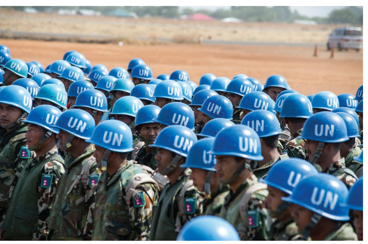
Nepalese peacekeepers arrive in Juba from Haiti to reinforce the military component of the UN Mission in South Sudan (UNMISS).

died, at least one of them probably a preventable death. 6 The impact on peacekeepers' morale was devastating.