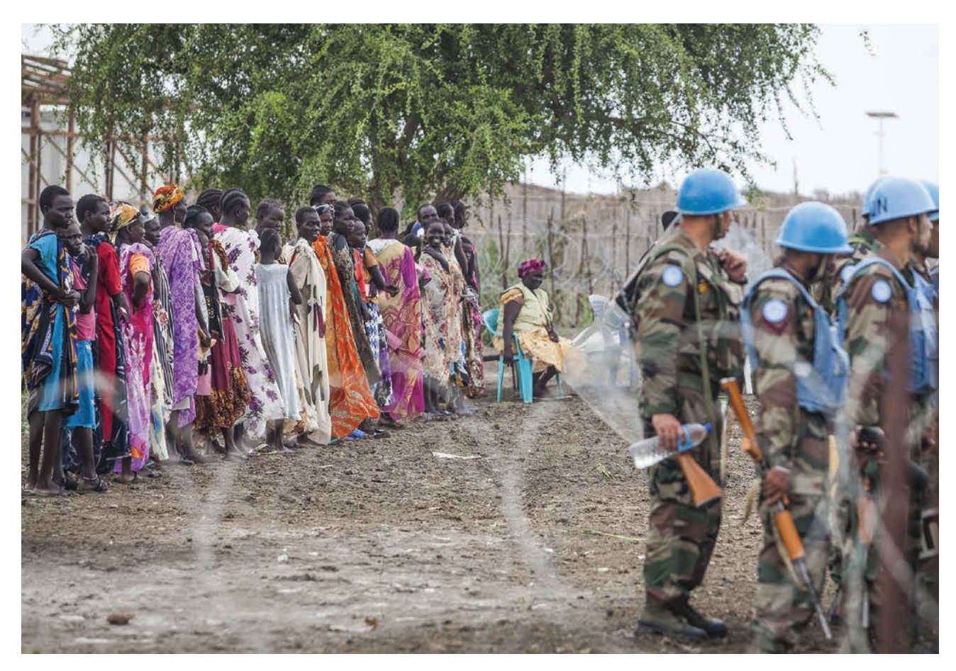
A UN Protection of Civilians Site (POC), Malakal, South Sudan.

reported feeling that their safety was significantly improved as a result of UNMISS' presence.3 Just two months later, however, UNMISS troops in Leer refused to open their gates or provide any other form of protection to civilians fleeing nearby violence. One group of civilians who were turned away from the base were attacked shortly afterwards and at least eight women were reportedly raped.4 Had they not lost time approaching UNMISS for protection, they may have run directly to their usual hiding places, and escaped the attack.