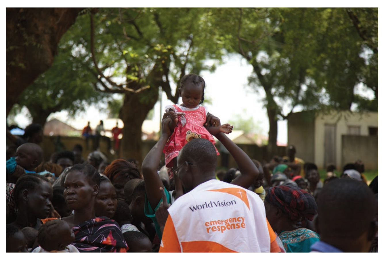
World Vision's emergency team responding to the South Sudan crisis.