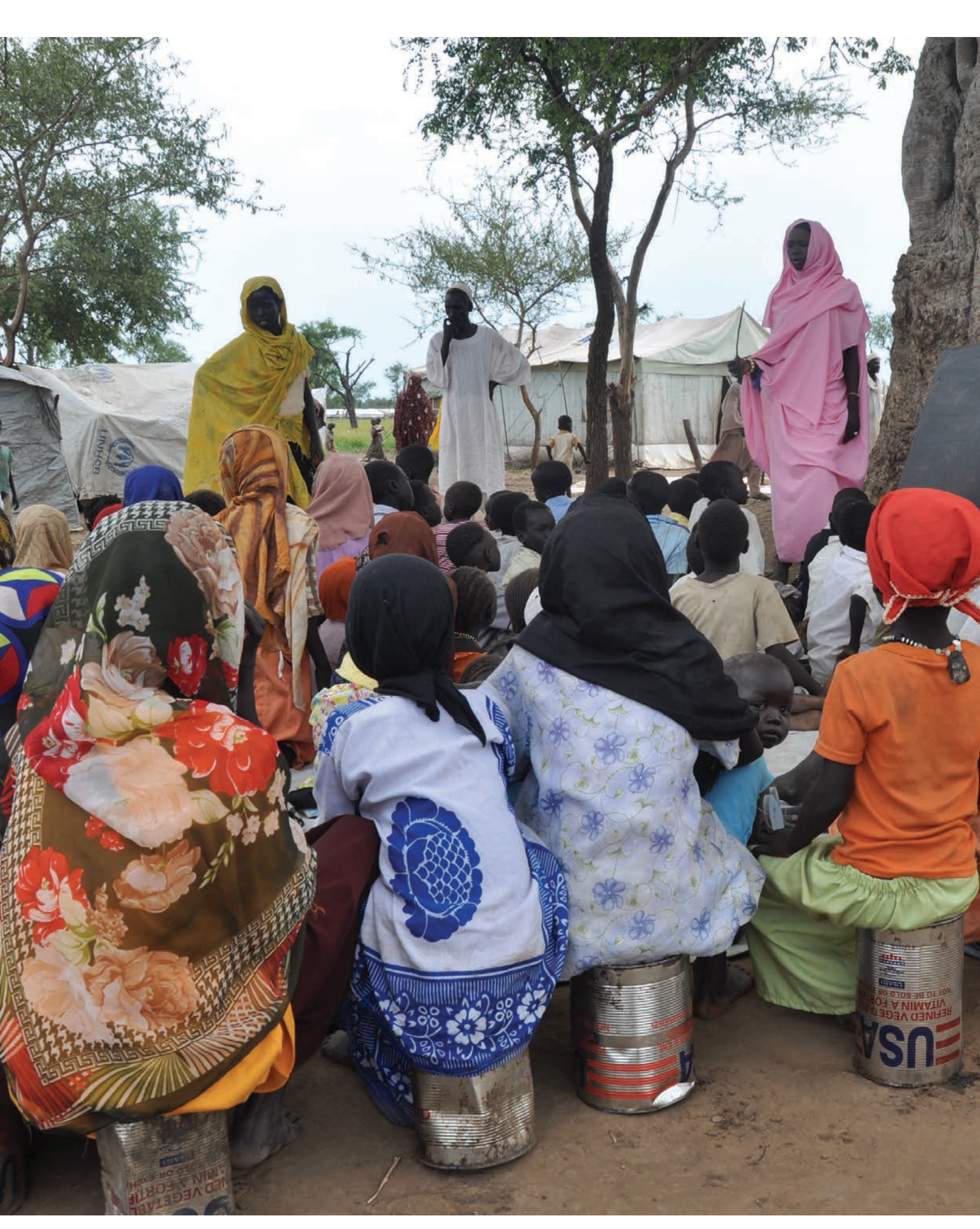
A school under a tree in Jamam refugee camp, South Sudan.