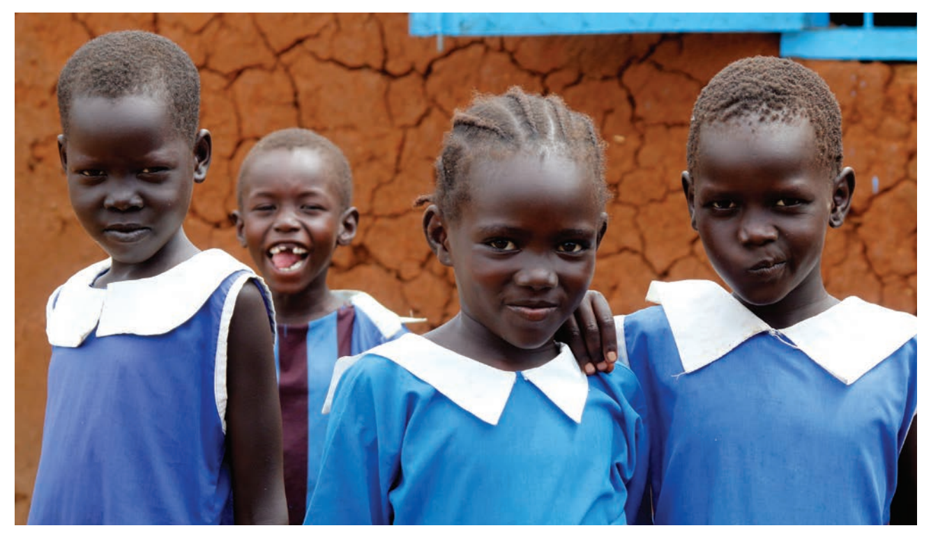
Schoolgirls in Bangasi Primary School in Yambio (November 2016). This school has received annual school grants through GESS since 2014.

conflict. As a development programme, GESS was designed to support education systems and structures through a systemic, nationwide approach in partnership with the government, and capacity-building and a high degree of ownership by the government at all levels was envisioned from the start. As the conflict unfolded, it was important for the programme to remain strictly non-political. The programme management team had to manage and mitigate political risks, including the possibility that support to contested areas was opposed or blocked by the programme's government counterparts. This was done by adopting 'Do No Harm' and 'Equity' as main operating principles.