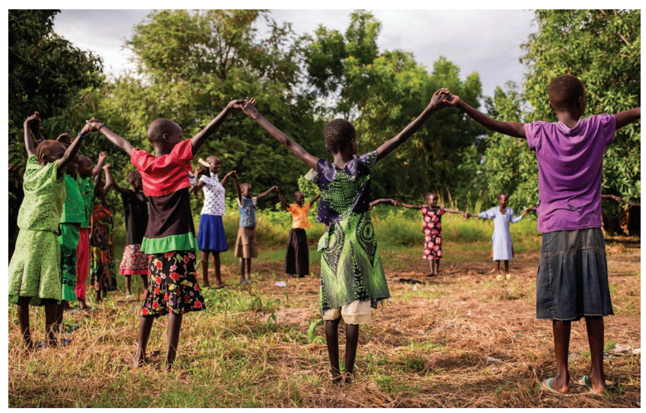
Children play in a child-friendly space in Nyal payam after fleeing fighting in Leer.

we can do something different, we are doomed to go round in the same circles, and continue to fail the people of South Sudan.