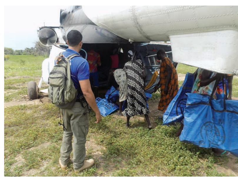
Survival Kits are offloaded from a UN Humanitarian Air Service helicopter in the Nyakni Highland.

As the kits were being developed, all the parties concerned agreed that protection had to remain the key determining factor. It was also agreed that some of the risks could be mitigated by keeping assistance packages extremely light a maximum of 9kg - as larger, heavier kits would mean more delivery helicopters over a longer period of time and thus greater risk for both beneficiaries and humanitarians.<sup>2</sup> Their weight was also kept down so that beneficiaries could carry them easily while on the move to a safer location. Additionally, it was agreed that humanitarians needed to figure out ways to make the most of limited 'windows of opportunity' where access was possible. Given the air assets available, pushing for full packages of assistance would not only increase the risks to beneficiaries but also lead to missed opportunities if, for example, only one sector was able to fly its stock in the limited time period available. Thus, it was agreed that providing a