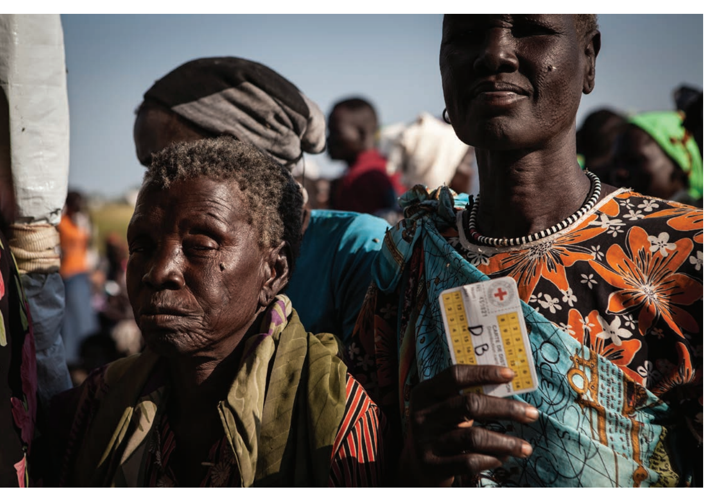
People with their registration cards for a food distribution in Jonglei State, Waat.

document requirements of the L3 machinery, centring many actors and decisions in the capital and making it more difficult for staff to get to the field, where the needs were.3 Throughout the response, the consensus was that the humanitarian community was not reaching people in need in less visible and insecure areas. The humanitarian system became absorbed by its own processes and priorities, including cluster funding requirements from the pooled funds mechanism and the production of the Humanitarian Needs Overview and Humanitarian Response Plan, as noted during an InterAction mission in November 2015.