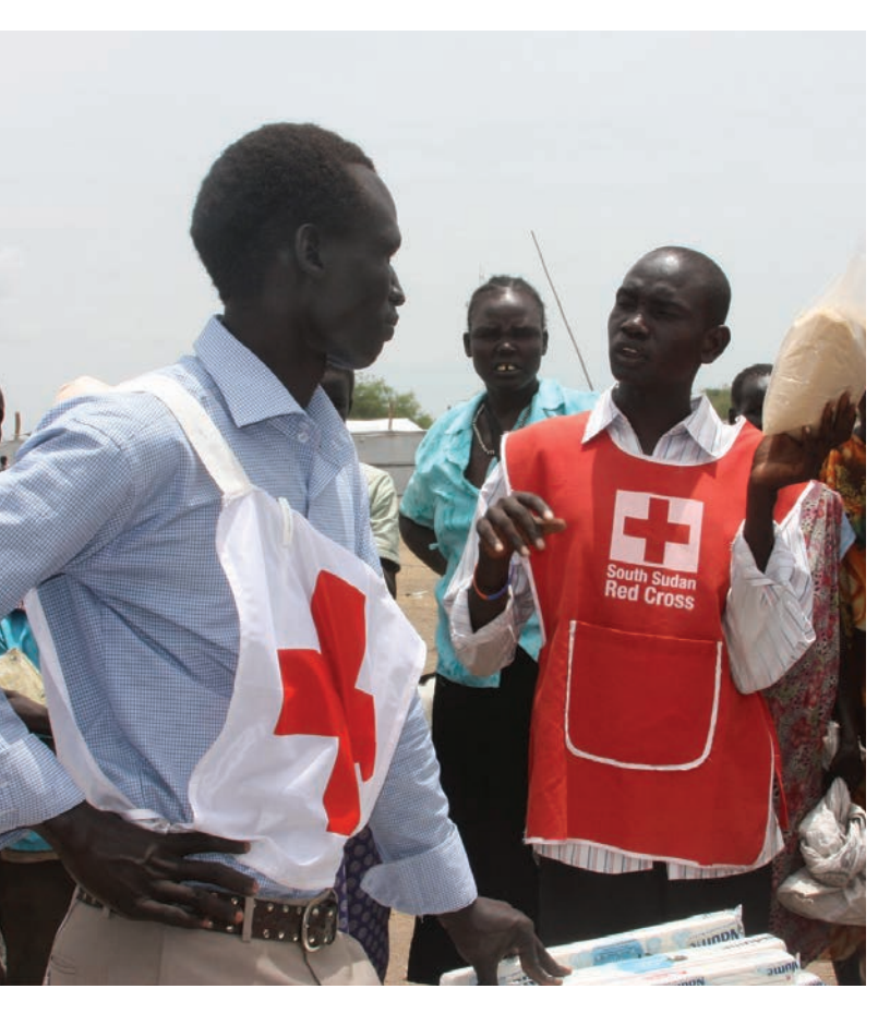
A member of the local Red Cross helping distribute much-needed food to vulnerable people, South Sudan.

better information on organisational capacity. The forum has also convened a peer-support working group to encourage shadowing and mentoring.