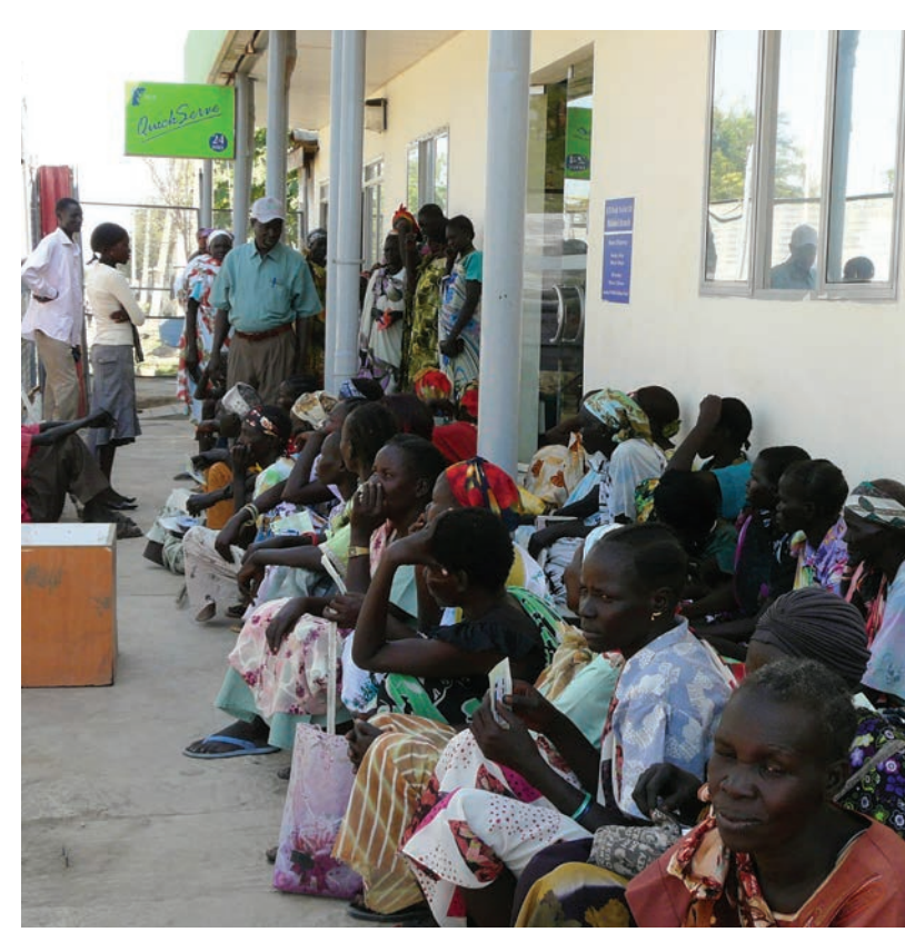
People queuing with their cash vouchers outside a bank in South Sudan.

Even in the deep bush people come together at established or impromptu marketplaces - sometimes even negotiating temporary ceasefires or crossing conflict lines to go to the market. In one county in Jonglei State, warring factions have agreed that children and women can cross conflict lines safely to shop at local markets. In another area, in Central Equatoria, warring tribes put their weapons aside to attend massive cattle