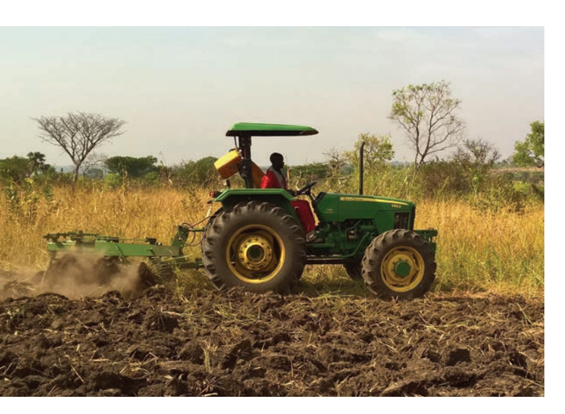
Agricultural service provider ploughing the fields of farmers in Morobo County, Central Equatoria.