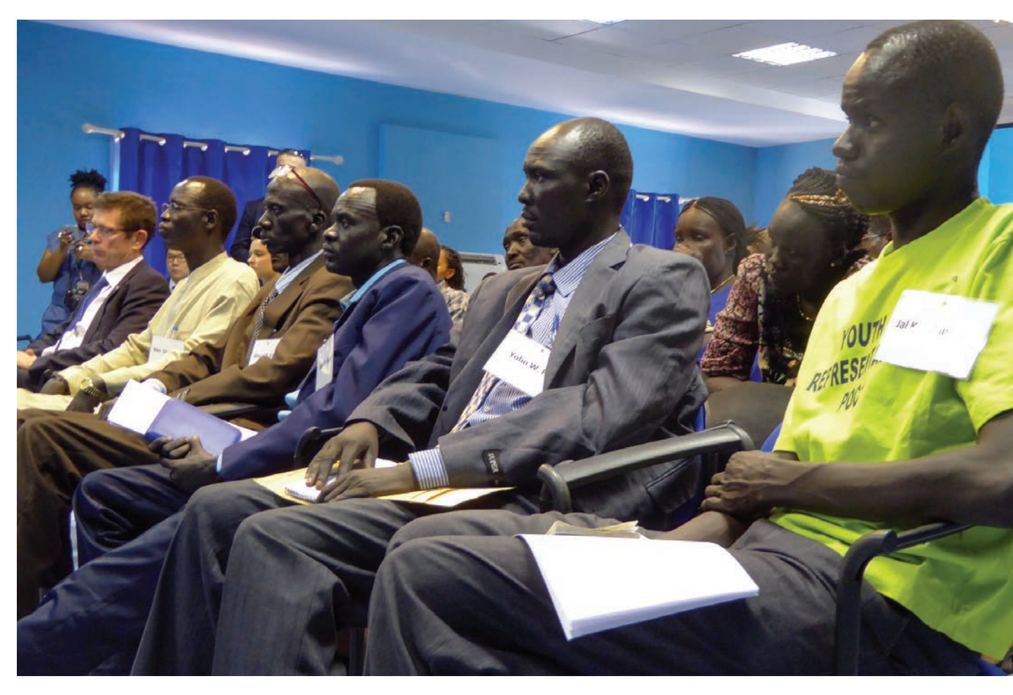
The UN Secretary-General meets with representatives of IDPs, UN agencies and NGOs during a February 2016 visit to Juba.

Regulating NGOs is also linked to controlling and having greater oversight over aid to opposition areas. Essentially, aid is being used to punish opposition and reward loyalty. The RRC has said that it intends to use the law to influence which NGOs provide assistance in certain areas and to limit advocacy and NGO engagement on political issues. In August 2016, the law appeared to be used to silence civil activists when, according to an Associated Press article, the government instructed the Community Empowerment for Progress Organisation (CEPO), a national NGO, to 'shut down within two weeks or be considered illegal'.3