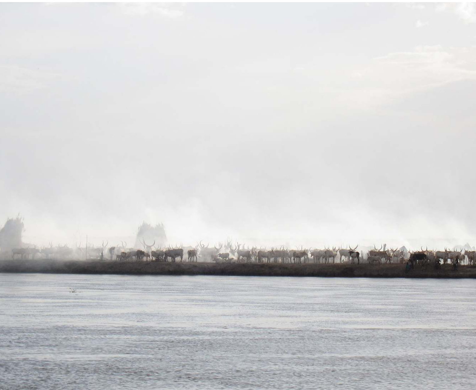
A cattle camp across the river Nile in Bor, South Sudan.