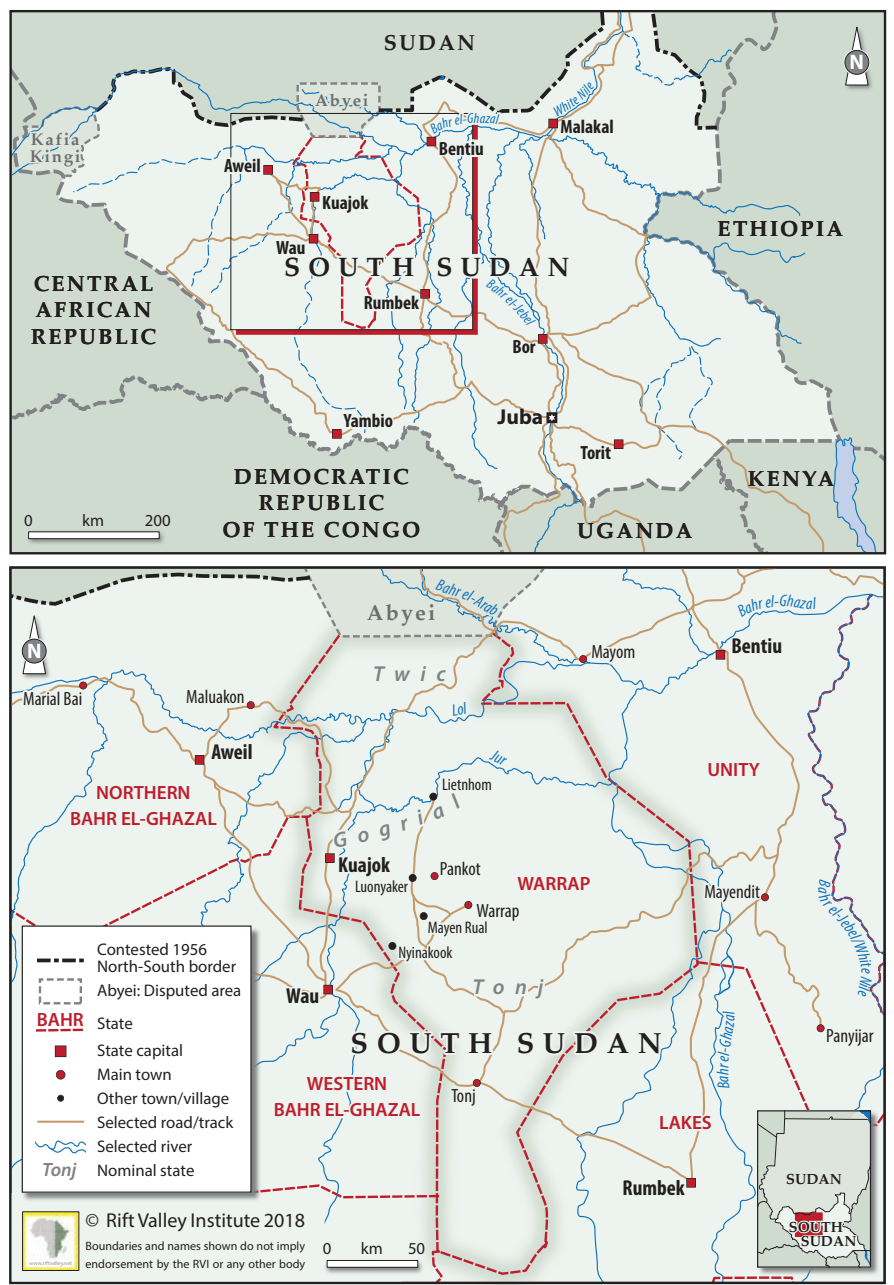
South Sudan states are according to the Comprehensive Peace Agreement (2005) Nominal states are according to 2 October 2015 decree